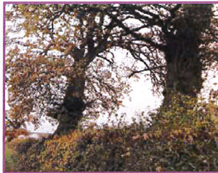
Photo: Hedgerow with large trees