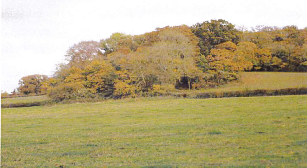
Photo: Surrounding Countryside

Chudleigh is an ancient town on a limestone ridge, meaning that the landscape is riddled with caves and old quarries. Lanes and footpaths crisscross the rich countryside which is a Special Area of Conservation for greater horseshoe bats.