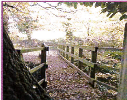
Photo: Country path